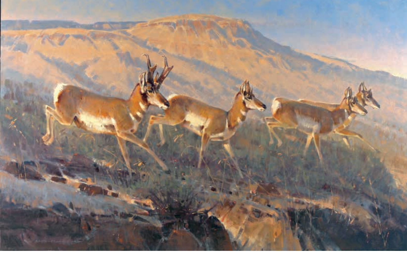
High Desert Tail Wind, oil on linen, 30 x 48"